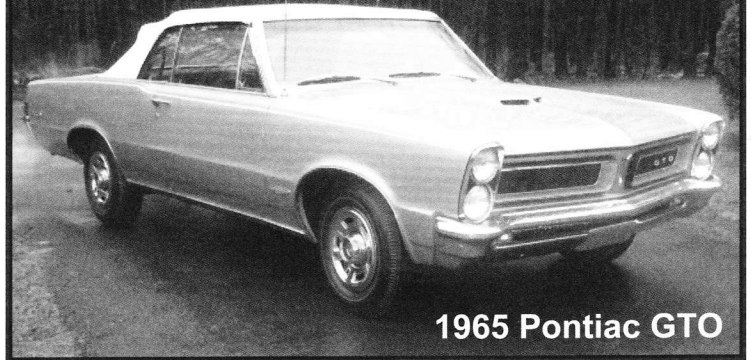
1965 Pontiac GTO