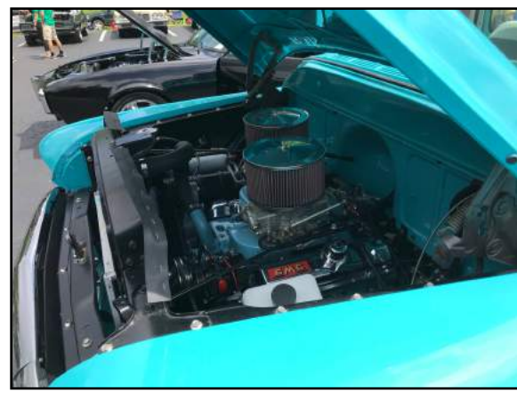
GMC Looking Good at The Dells