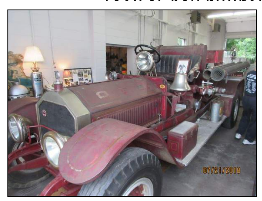
1917 American LaFrance model 45

We stopped for lunch at the Blain Diner, providing time for Ponti-yakking and visiting. We saw some great countryside, and a number of covered bridges, driving across 2 of them. Fortunately the rain held off till late in the day. After returning to New Bloomfield, a mid-year business meeting was held to discuss the convention, as well as remaining activities for the year. It was decided to cancel the proposed private collection tour in October, and schedule a convention update meeting instead. It was noted that Art and Larry will be coming in for the November meeting, and we need to be prepared. After the meeting, a few members joined Don to visit a nearby restored gas station.