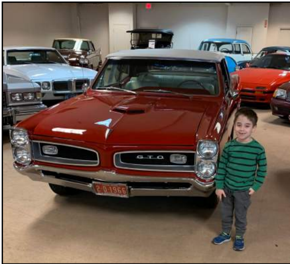
WHAT EVERY 6 YR. OLD WANTED FOR CHRISTMAS