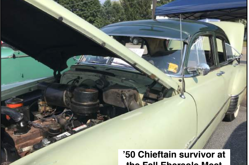
the Fall Ebersole Meet