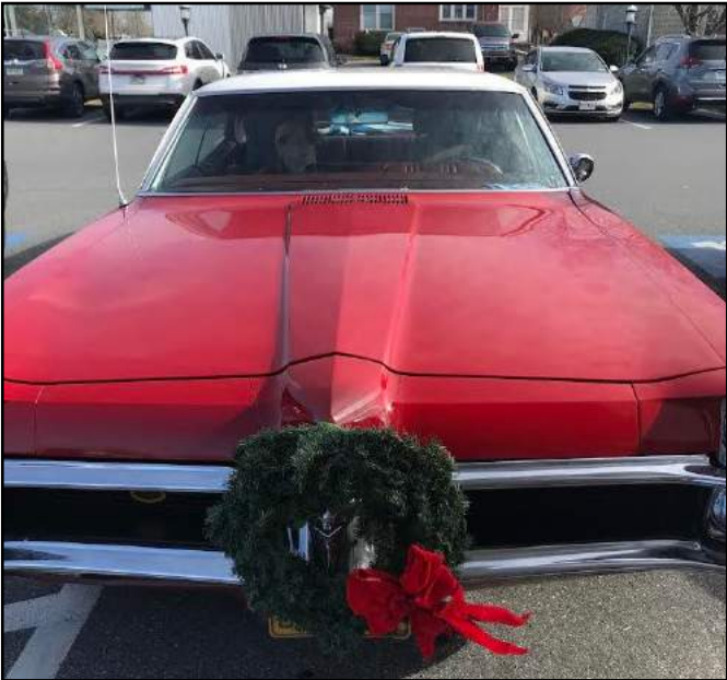
Memories of Christmas past