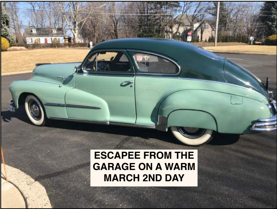
ESCAPEE FROM THE GARAGE ON A WARM MARCH 2ND DAY