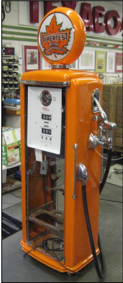
Gas Pump Project from Bill McIntosh