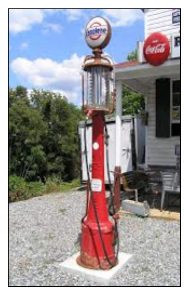
Page 3: Everything you ever wanted to know about "Petroliana" collecting