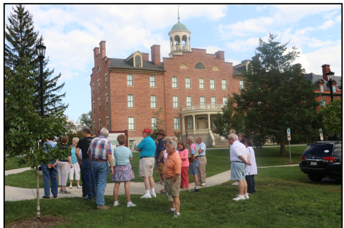
Seminary Ridge Museum