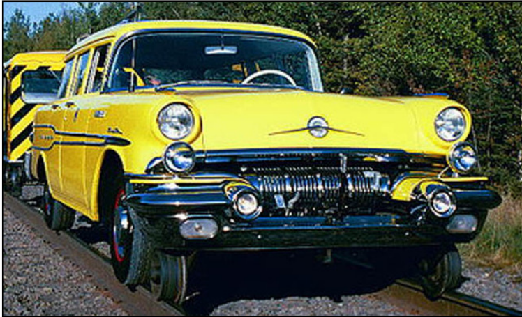
I knew Ralph & Peggy Keller took the train to the convention, but this is classic travel at its best!