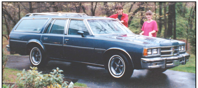
Old Lucy - see article inside

The Original Pontiaction Chapter... The Keystone State Chapter Pontiac Oakland Club International