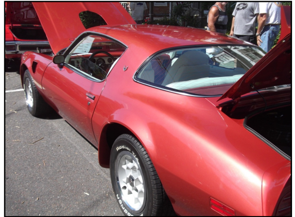
Nice survivor TransAm at Newtown with hood decal delete option