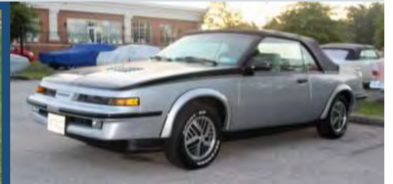
Chuck Catalano's Points Judged Gold Junior Stock 1987 Sunbird GT Turbo convertible