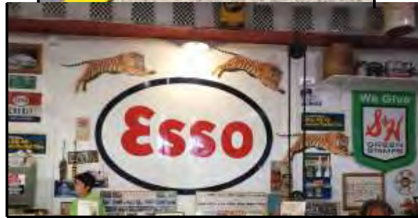
The tiger on this sign is named Tessa. She was used in Esso commercials. I met her when I was in Aruba in 2002.

presence of General and Mrs. Ulysses S. Grant. Thursday was a tour that I had anticipated since registering for the convention. It was a long bus ride