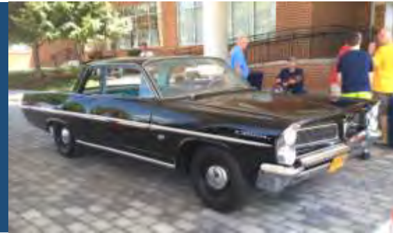
Ken Colacino's Most Outstanding Vehicle 1963 Super Duty