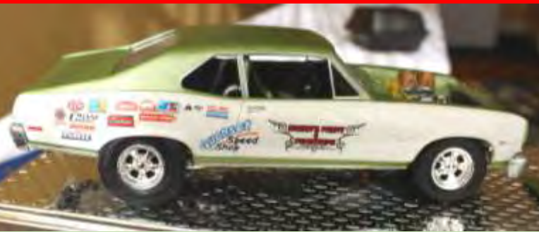
This is one of Tom Szymczyk's entries in the model car contest, a Valspar White 1973 Ventura with a 455 engine. The top is painted Citrus Green. Tom won First Place in the Senior Class.