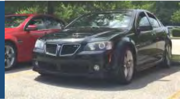
Frank Church's 2008 G8