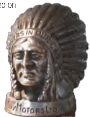
1930s – 1970s Guy Motors, Ltd. Indian Head Great Britain

Hershey. At the AACA museum, the Keystone State Chapter had a nice showcase display plus a few of their Pontiacs. Number one highlight for me was the vast display of hood ornaments on the second floor. The Pontiac collection contained a real one just like the replicas awarded to Concours exhibitors. In the foreign collection, I found an Indian chief ornament used on British cars manufactured from 1930 to 1970 by Guy Motors, Ltd. Amazing!