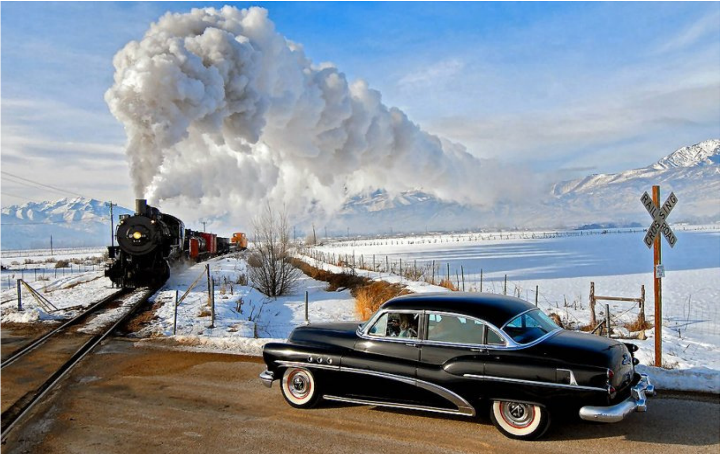
When trains were trains and cars were cars