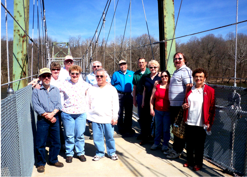
Spring Tour— New Hope/Washington Crossing PA