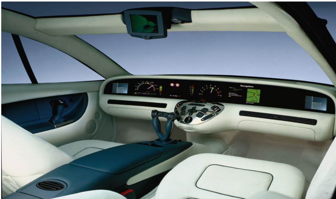
No Steering Wheel, No Pedals, Are You Ready?

See the club photo gallery on the club web site: www.kscpoci.org then select Photo Gallery and pick your event or photo grouping. Also see the color version of each newsletter—select the Newsletters button